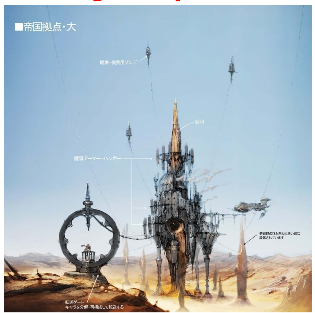
* \( \) New Concept Art for the Imperial Stronghold

From a programming standpoint, the multi-tiered code used in the current UI system has become overly complex, preventing us from making the improvements we have planned.